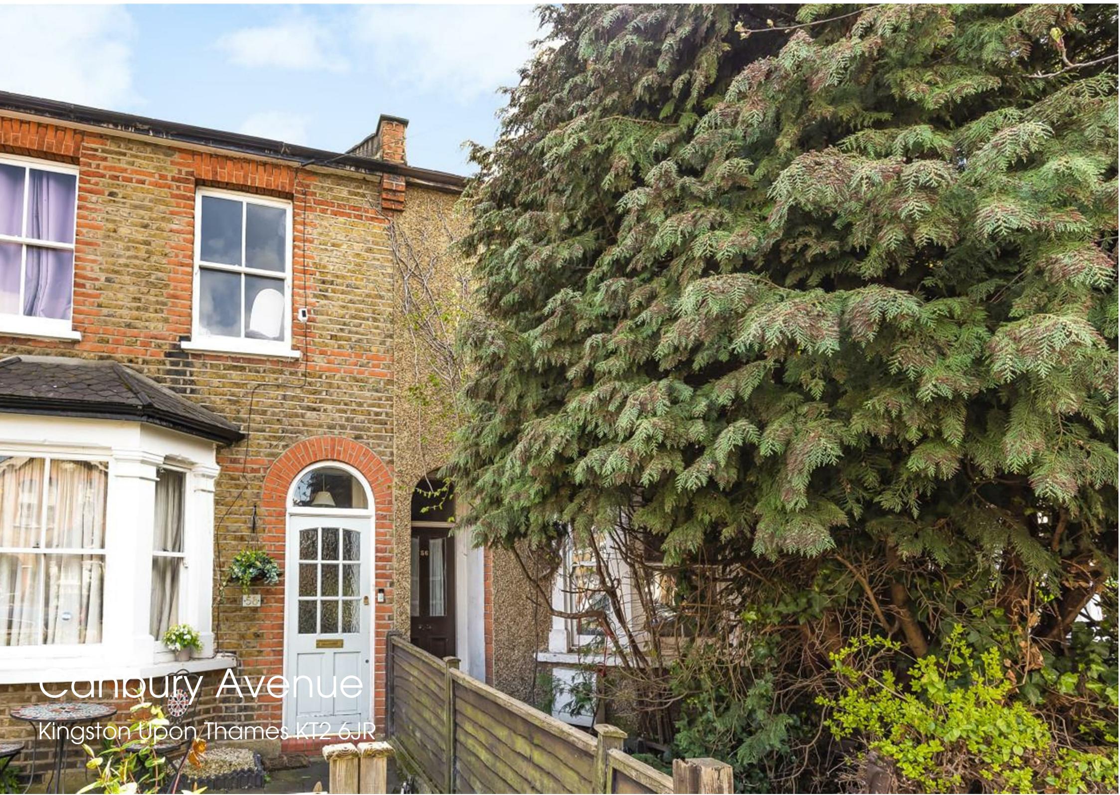
Canbury Avenue Kingston Upon Thames KT2 6JR

34 Richmond Road Kingston upon Thames Surrey KT2 5ED www.gibsonlane.co.uk Tel: 020 8546 5444